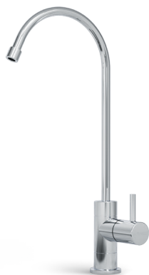
High Loop Designer Faucet DFU180